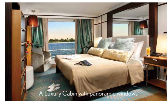
A Luxury Cabin with panoramic windows