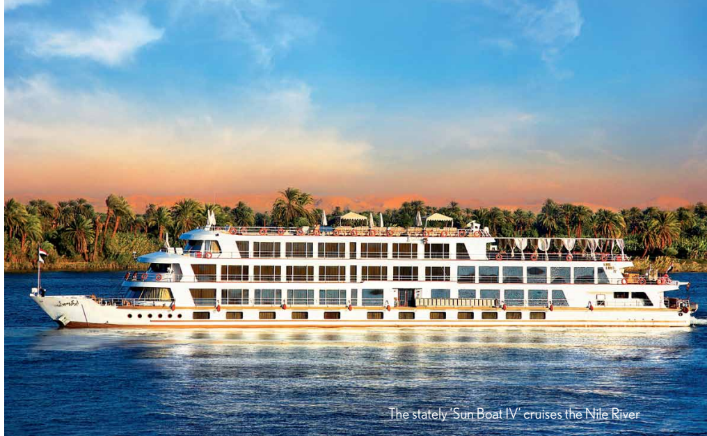
The stately 'Sun Boat IV' cruises the Nile River