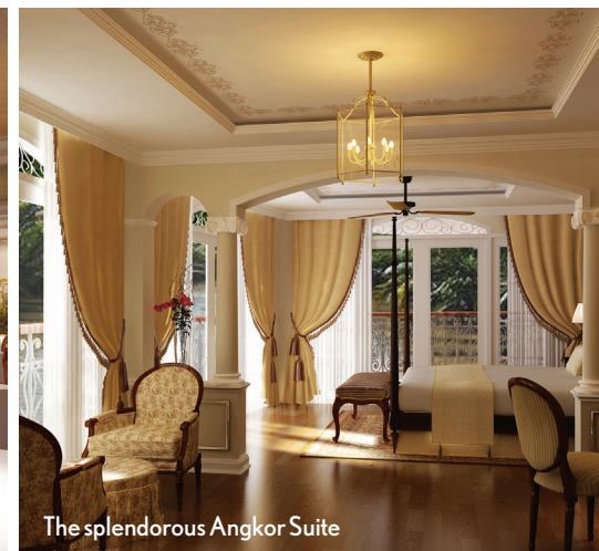
The splendid Angkor Suite