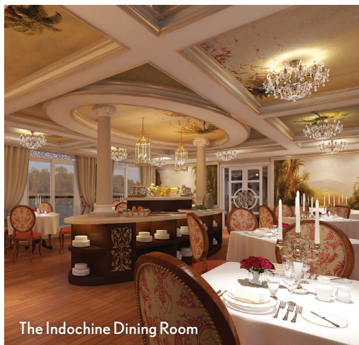
The Indochine Dining Room

NOTE: The following suites feature fixed king beds and cannot be converted into twin beds: Angkor Suites (201 & 202), Tonle Suites (203 & 204)