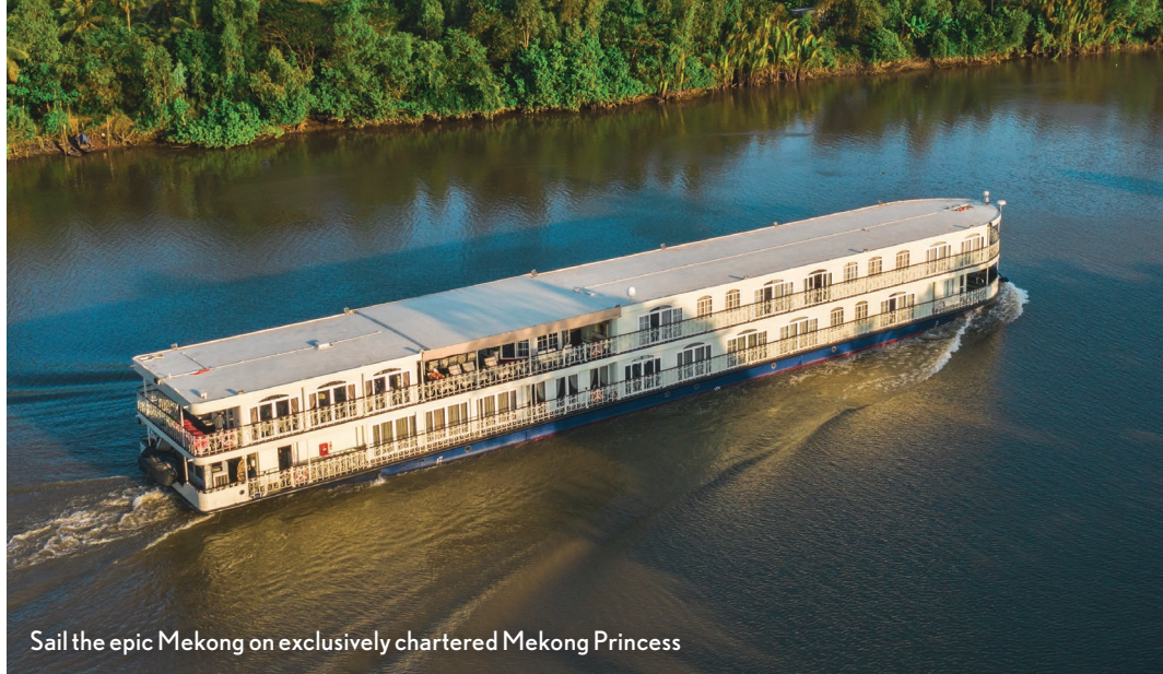
Sail the epic Mekong on exclusively chartered Mekong Princess

While plying the waters, pause to watch life unfold from the Observation Deck, recounting activities in the Lounge and staying connected in the Library. Keep in shape in the fully equipped fitness center.