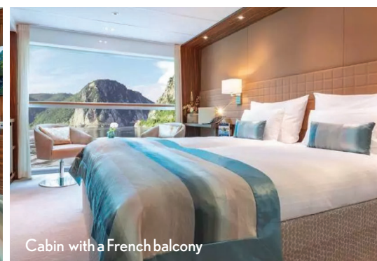
Cabin with French balcony