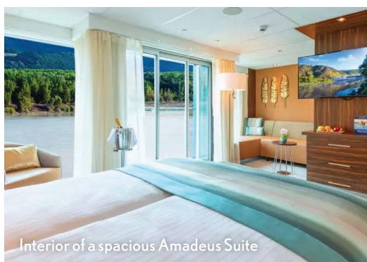
Interior of a spacious Amadeus Suite