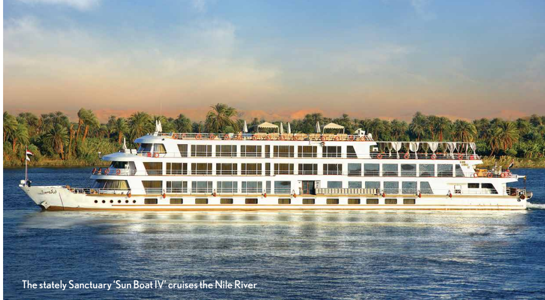
The stately Sanctuary 'Sun Boat IV' cruises the Nile River

Sanctuary 'Sun Boat IV' offers exquisite dining and peerless service, including excursions to the Nile's greatest monuments led by expert Egyptologists.