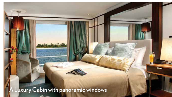
A Luxury Cabin with panoramic windows